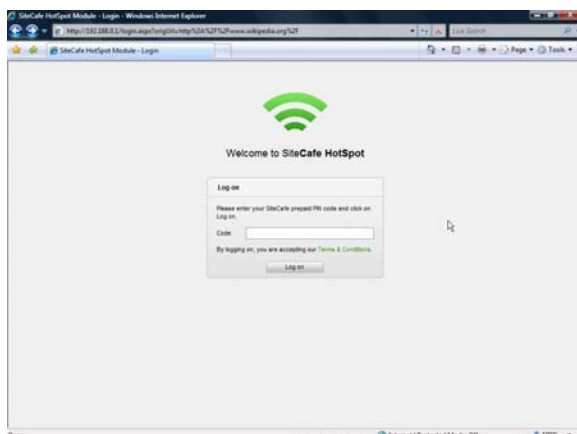
Fig.: WiFi access requires code input

Customers who would like to use the access you are providing only have to switch on their laptops and select your WiFi network. When they open their browser, users will automatically be taken to a page prompting them to enter or purchase a valid prepaid PIN code.